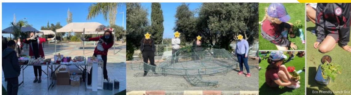
CYPRUS STUDENTS AGED FROM 12 TO 19 PLASTIC POLLUTION FOOD WASTE