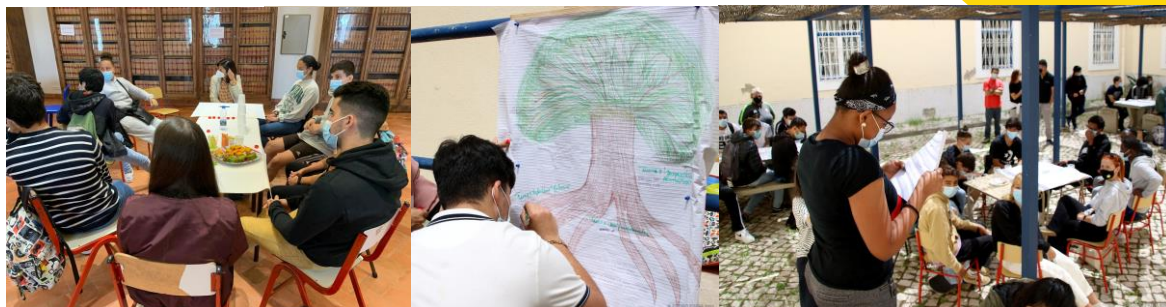
PORTUGAL STUDENTS AGED FROM 15 TO 19 HEALTHY EATING HABITS FOOD WASTE