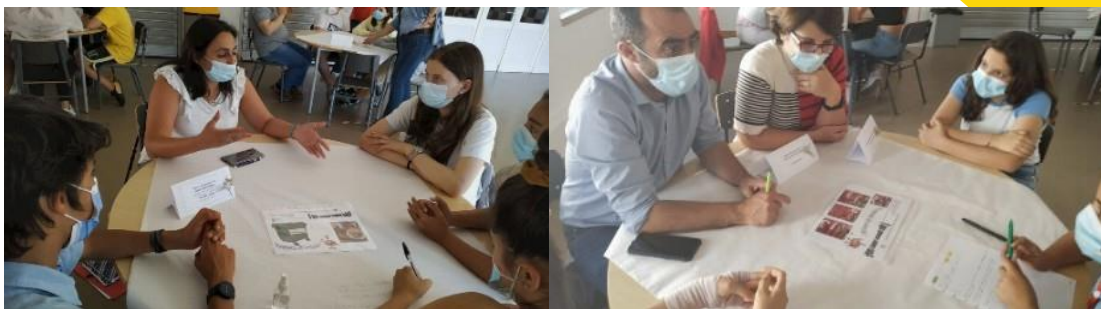
PORTUGAL STUDENTS AGED FROM 12 TO 15 HEALTHY EATING HABITS FOOD WASTE