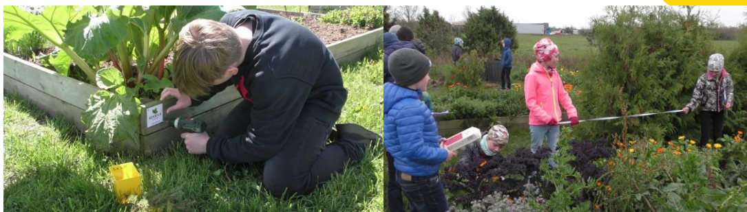
ESTONIA STUDENTS AGED FROM 11 TO 12 ENVIRONMENT LEARNING OUTDOORS