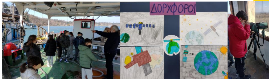
GREECE STUDENTS AGED FROM 10 TO 13 FOOD PRODUCTION ENVIRONMENT