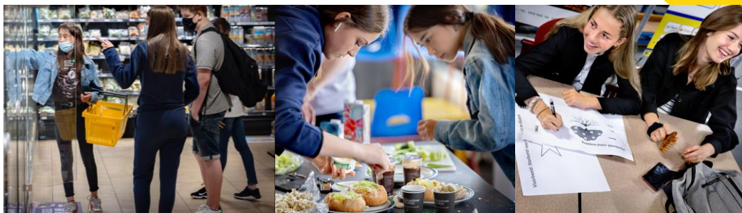
THE NETHERLANDS STUDENTS AGED FROM 14 TO 16 HEALTH SUSTAINABILITY FOOD

Helping local businesses acting sustainably