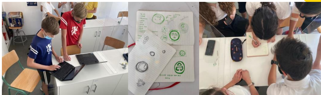
CYPRUS STUDENTS AGED FROM 12 TO 13 FOOD PACKAGES WASTE RECYCLING